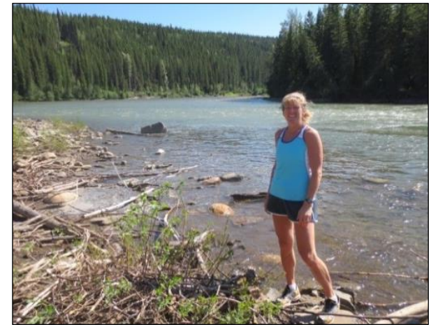
Murray River at Quality Mouth