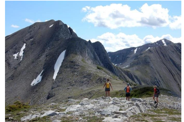
Hiking towards the Pinnacle