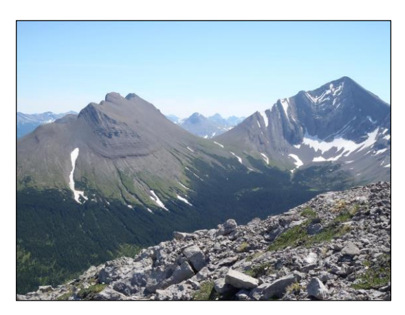
Mount Becker from ridge east of Bootski Lake

DISCLAIMER AND WARNING: The Province of British Columbia makes no representations or warranties regarding the accuracy, merchantability, fitness for a particular purpose, or completeness of any information contained in or otherwise comprising this map. Without limiting the foregoing, you are warned not to use this map for navigational purposes. This map may be generalized and may not reflect current conditions. Uncharted hazards may exist.